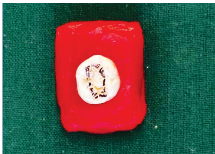
[Table/Fig-2]: Prior to creating the access cavity, the boundaries were delineated to ensure preservation of 1.5 mm of peripheral tooth structure circumferentially while keeping the marginal ridges intact.

Group 2 (SDR™): After obturation, etching was done with 37% phosphoric acid (3M ESPE, Bengaluru, India) and 5 th generation bonding agent was applied (Adper, 3M ESPE, Bengaluru, India) and cured for 20 seconds according to manufacturer's instructions.