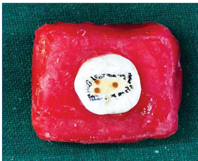
[Table/Fig-3]: Following the completion of access cavity preparation, the tooth structure displays intact marginal ridges without compromising their structural integrity.

SDR™ (Dentsply Sirona, Belmont, Australia) was incrementally placed along the perimeter of the teeth and cured. This method aimed to reinforce the tooth structure internally using SDR™.