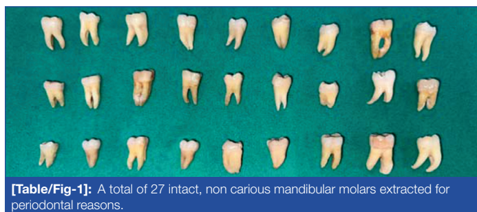
[Table/Fig-1]: A total of 27 intact, non carious mandibular molars extracted for periodontal reasons.

Inclusion criteria: A total of 27 non carious human lower molar teeth extracted for periodontal purposes were collected for the present study. The teeth were carefully examined using a dental operating microscope (LABOMED, Berlin, Germany) with 12.8x magnification to ensure specimen quality. Only intact teeth exhibiting no defects like fracture lines, cracks, decay, or previous endodontic treatments were selected for evaluating fracture resistance [Table/Fig-1].